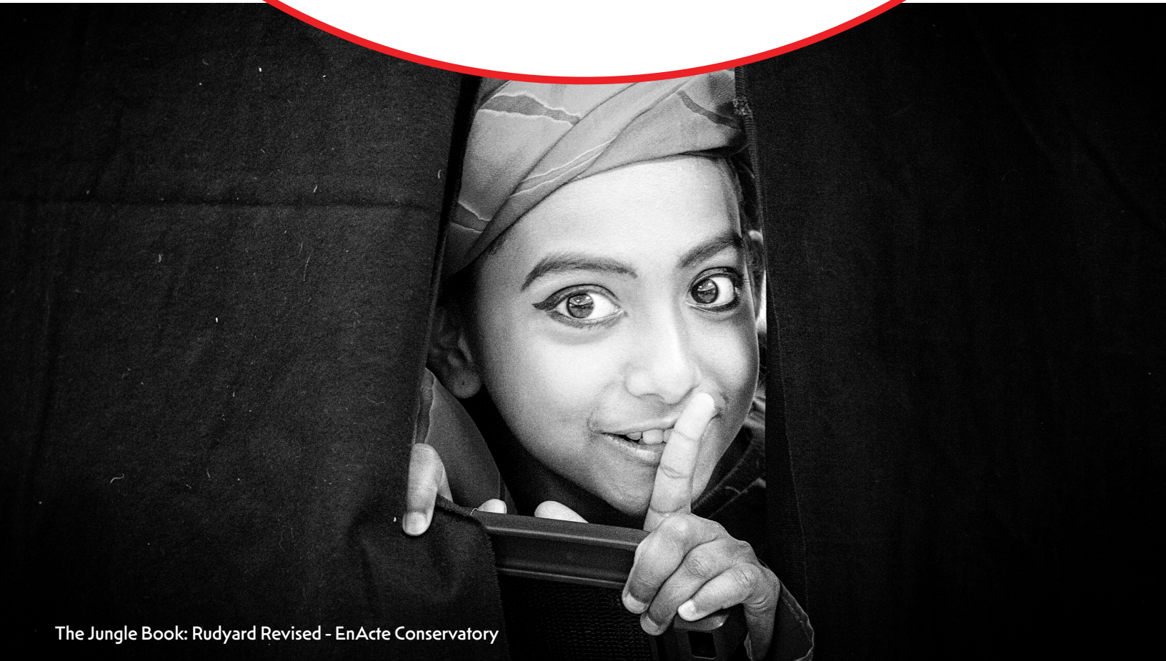
The Jungle Book: Rudyard Revised - EnActe Conservatory