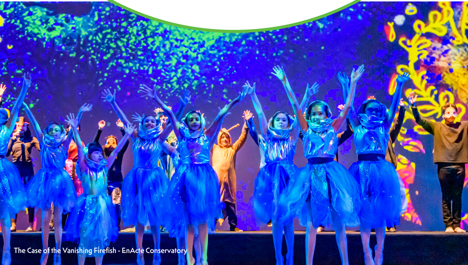
The Case of the Vanishing Firefish - EnActe Conservatory

Community building is at the heart of every non-profit and we consider this not only our serious responsibility but a true privilege. Aspire is: